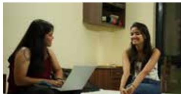
Comfortable and homely accommodation