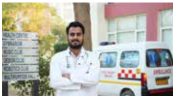
Top-notch Healthcare Facilities