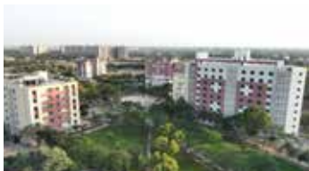
World Class Hostels