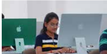
Advanced Computer Labs