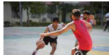
Sports and Recreation