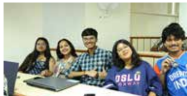
Seminar Halls and Discussion Rooms