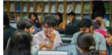
Library & Knowledge Resource Centre